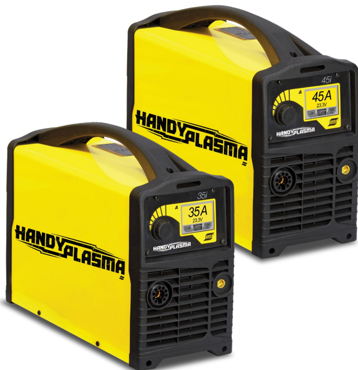
HandyPlasma 35i / 45i